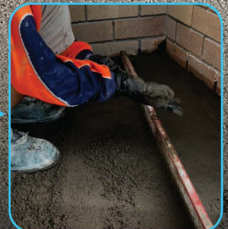
Apply to desired thickness