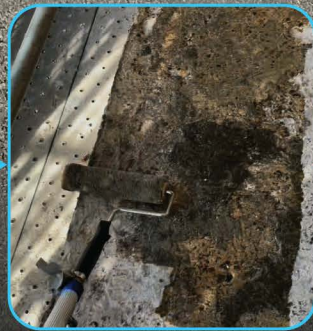
Prime the surface with Polycrete