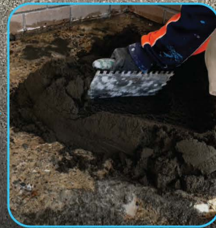
Apply the mix to the the wet primer surface